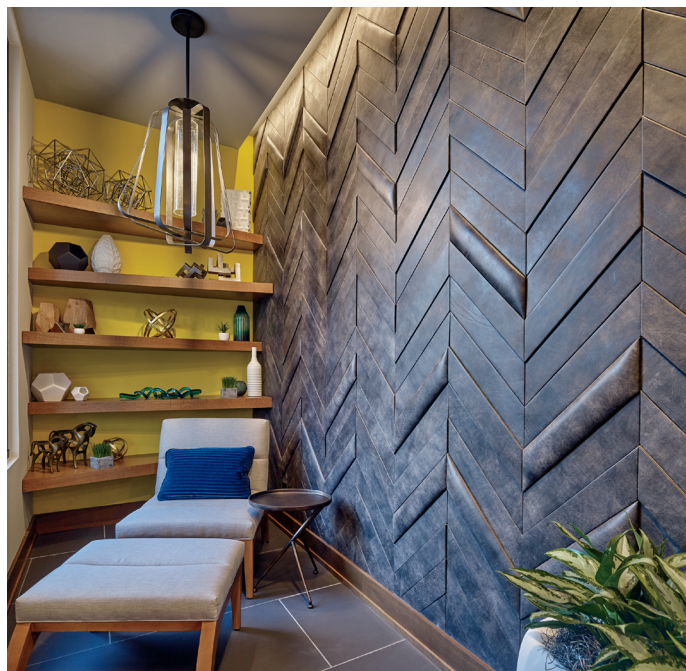
Native Blackfoot Parallelogram Wall Panels