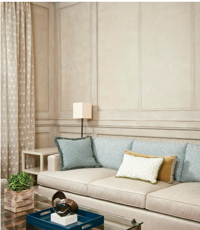
Native Apache Double Stitched Wall Tiles