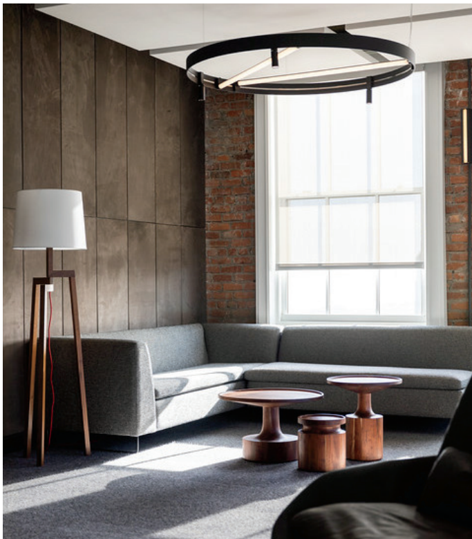
Allura Earl Gray Wall Panels Design: Lundberg Design