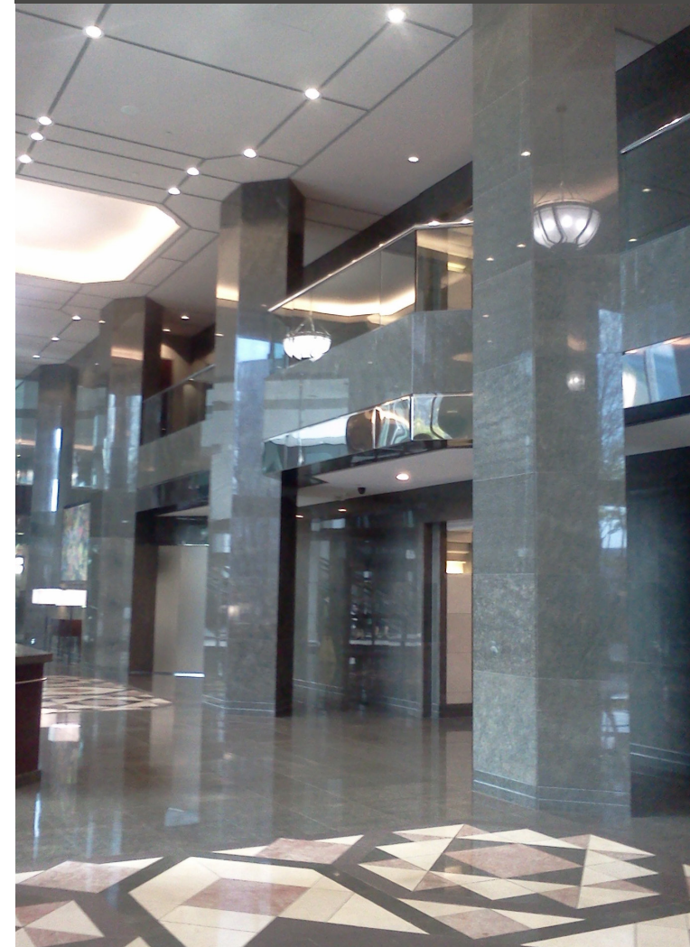
Buckhead Tower before the renovations