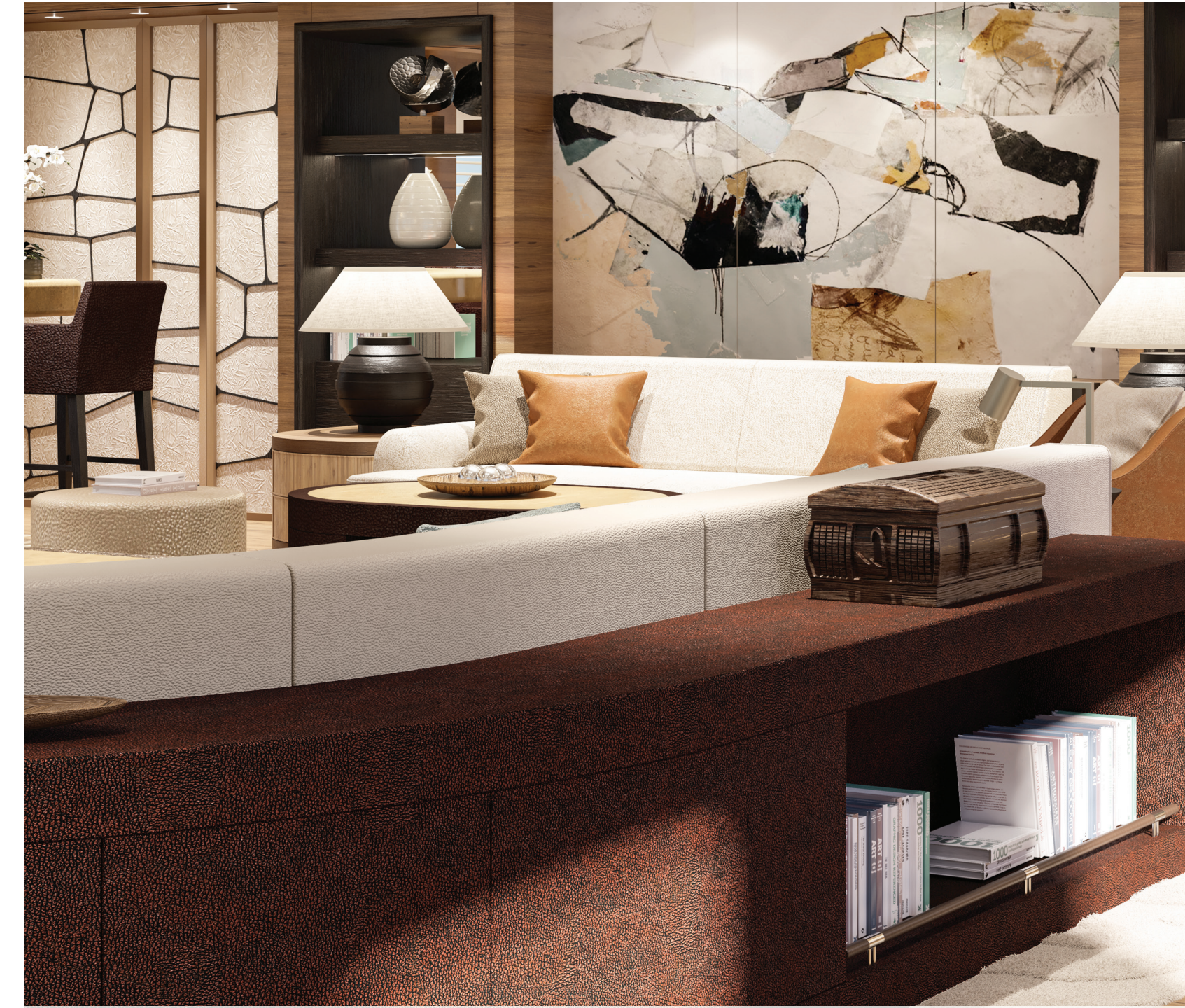
Channel the undulating shorelines and sensation of strolling a gravelly coastal footpath with Keyhaven. Relaxed and restful, this small grain leather embodies the unique colors and shapes of eroded rocks where fossils have embedded. Its granular, tactile pattern and handcrafted finish are a distinctive touch.