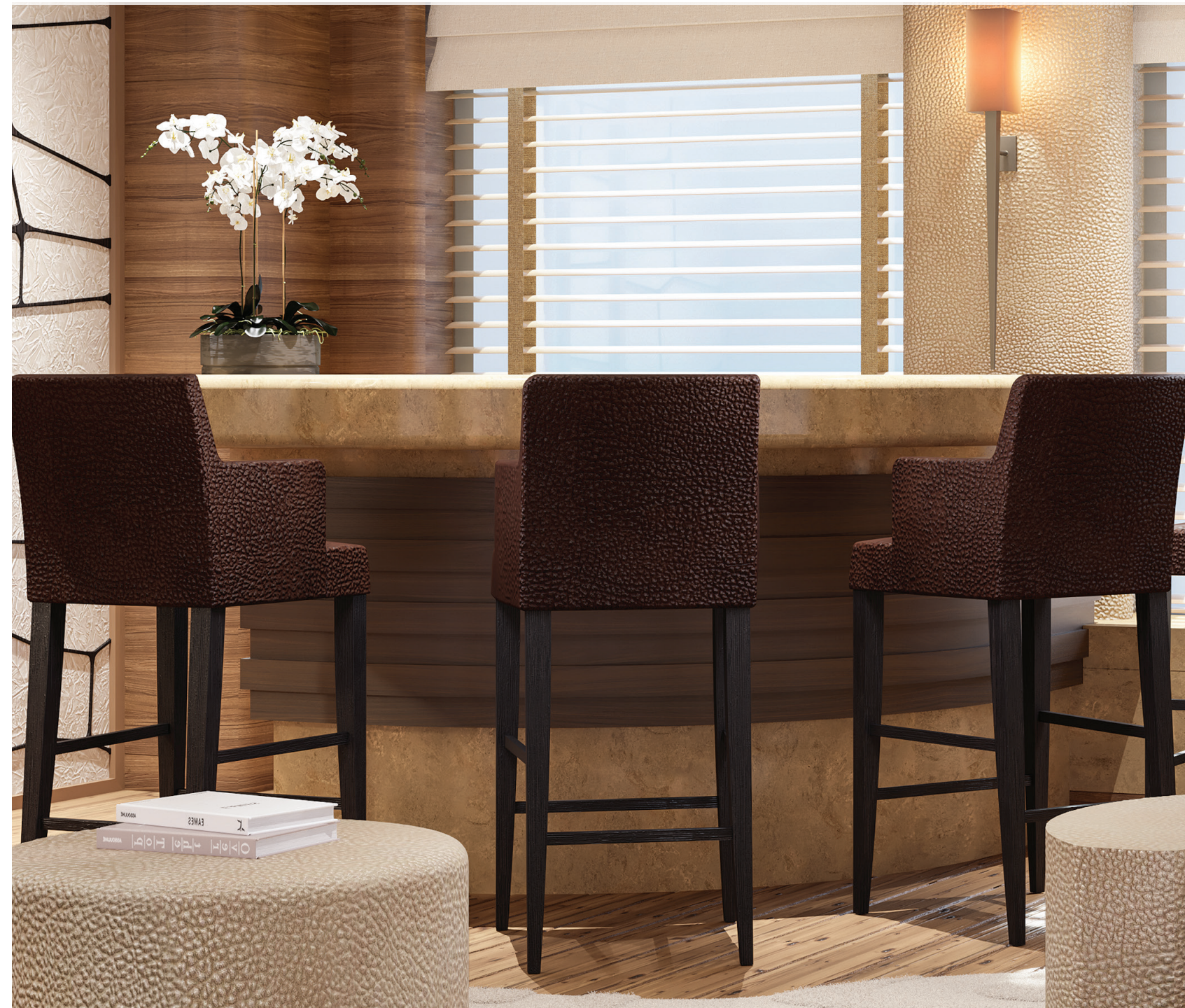
Exbury will rejuvenate your senses and realize your most vibrant dreams with a spectacular collision of color and texture. The exquisite and decadent details are exemplified with its large grain pattern. Exbury is finished with hand-tipping and antiquing, ensuring a beautiful and lasting appearance.