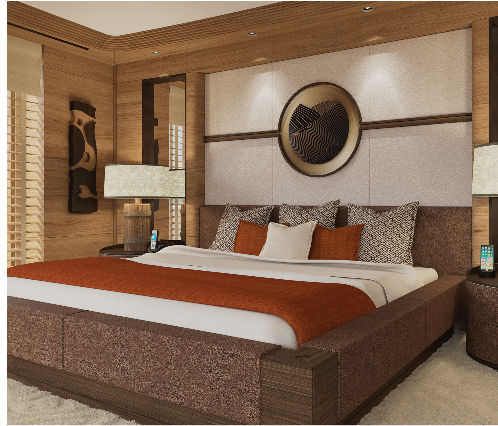
The mysterious continuity of the forest is embodied by Hawkhill. This roughout leather reflects the organic and evolving adaptability of our ever-changing world. Hawkhill is made in Italy, finished with natural resins, milled and artfully sanded to obtain the visceral textures found in our natural environment.