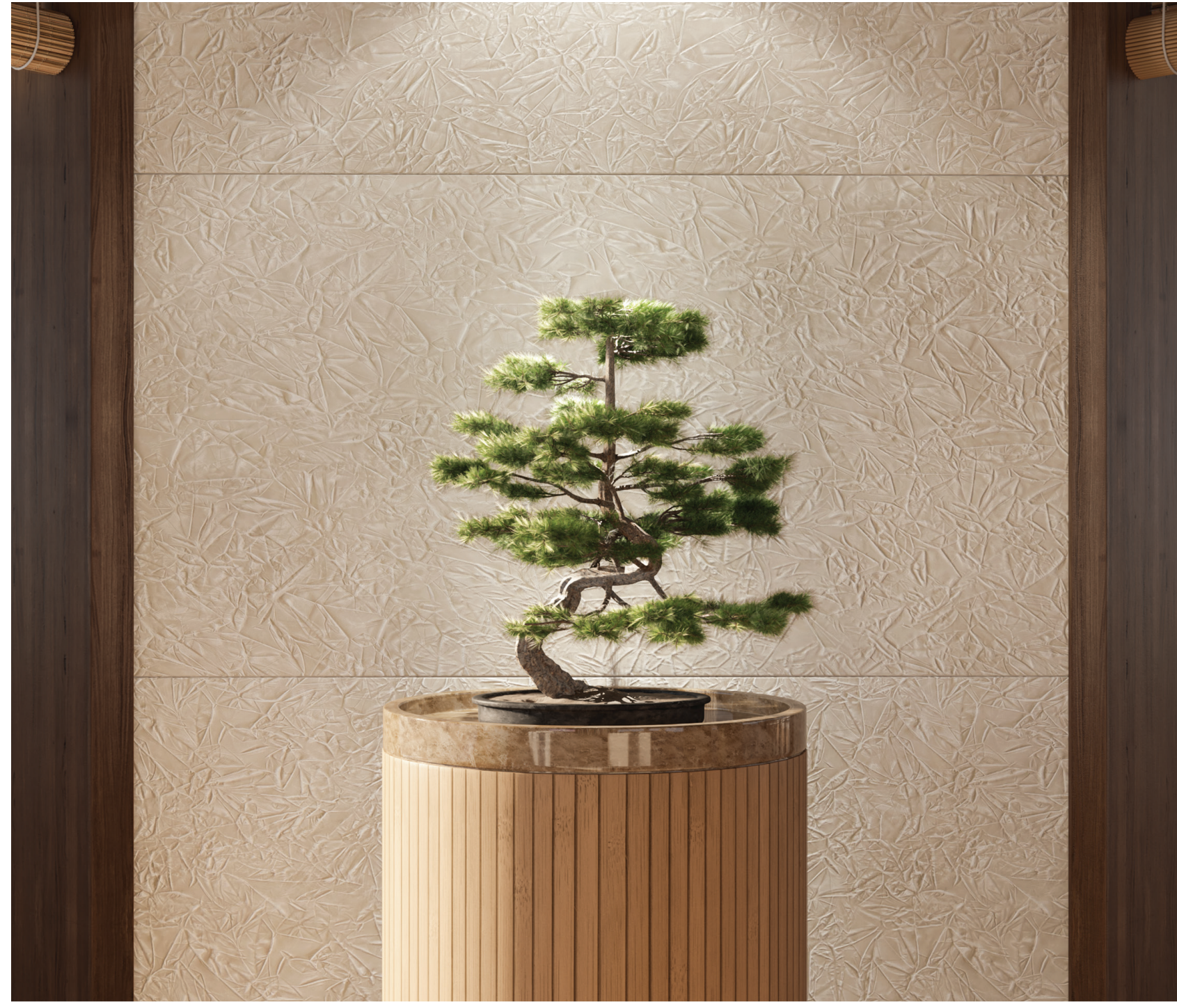
Earthy and layered, Bolderwood harkens the sanctuary of an ancient coniferous canopy. The embossed pattern evokes the rich resolute of the centuries-old, undisturbed woodland floor. Artistic hand finishing accentuates the pattern and gives depth to the final appearance.